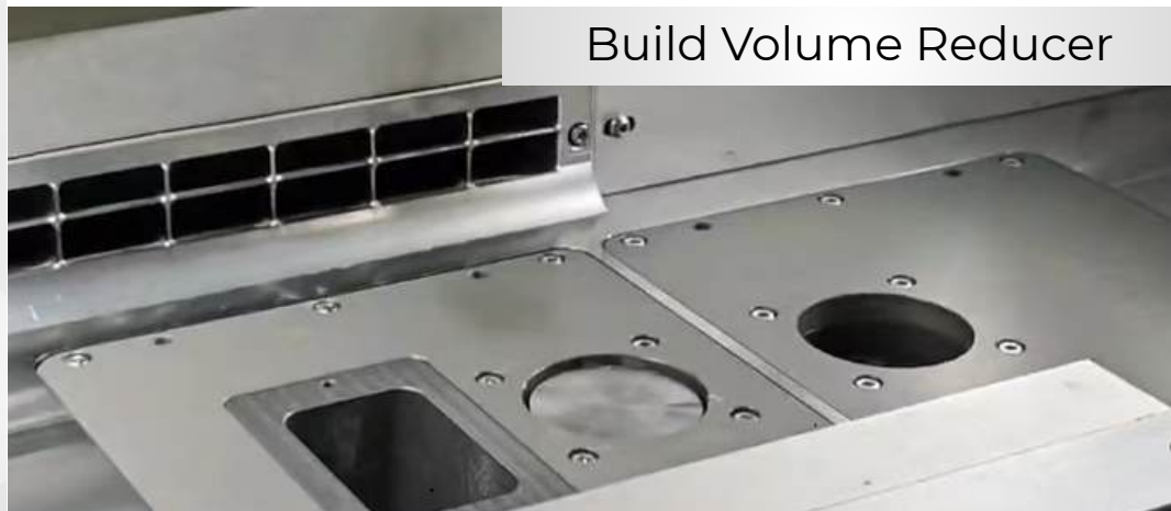
Build Volume Reducer

The ANiMA A1 is a compact yet highly versatile metal 3D printer engineered to meet the demanding needs of research institutions, material scientists, and advanced process developers.