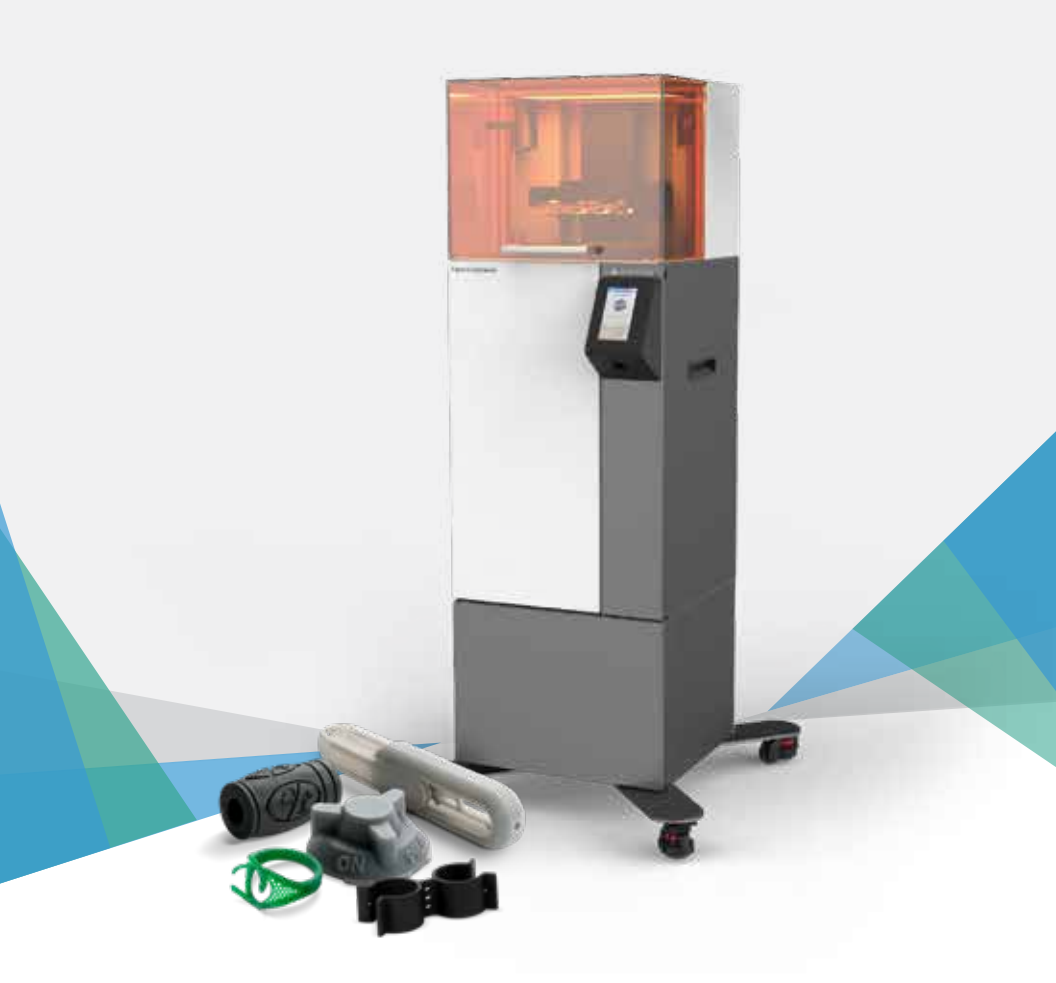
Figure 4° Standalone

Ultra-fast and affordable industrial 3D printer