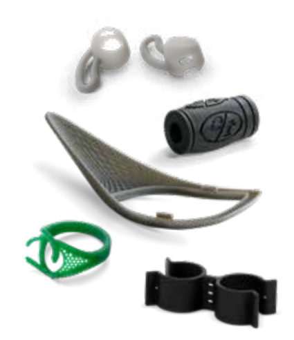
Figure 4<sup>™</sup> TOUGH-GRY 10

Create parts that combine high resolution with exceptional surface quality and mechanical properties from a variety of robust materials. Materials available for Figure 4 Standalone include a broad and expanding range of industrial materials, including cast and elastomeric materials. Quick and easy material changeover allows for functional prototyping and production application versatility with the same printer.